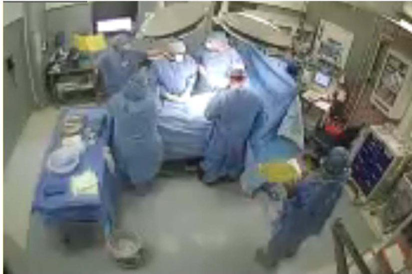
Figure 1 Wide-angle camera displaying blurred image of operating room and use of yellow surgical safety checklist.

operative time during the baseline phase (see online supplementary figures S2 and S3). Rooms with mean non-operative time of less than 300 min and average of 3.8 cases per day were classified as ‘fast’ rooms while rooms with mean non-operative time of greater than 300 min and average of 2.1 cases per day were classified as ‘slow’ rooms (see online supplementary figure S2). Subsequently, the ORs were stratified into fast and slow groups and randomised to feedback and no-feedback treatment groups.