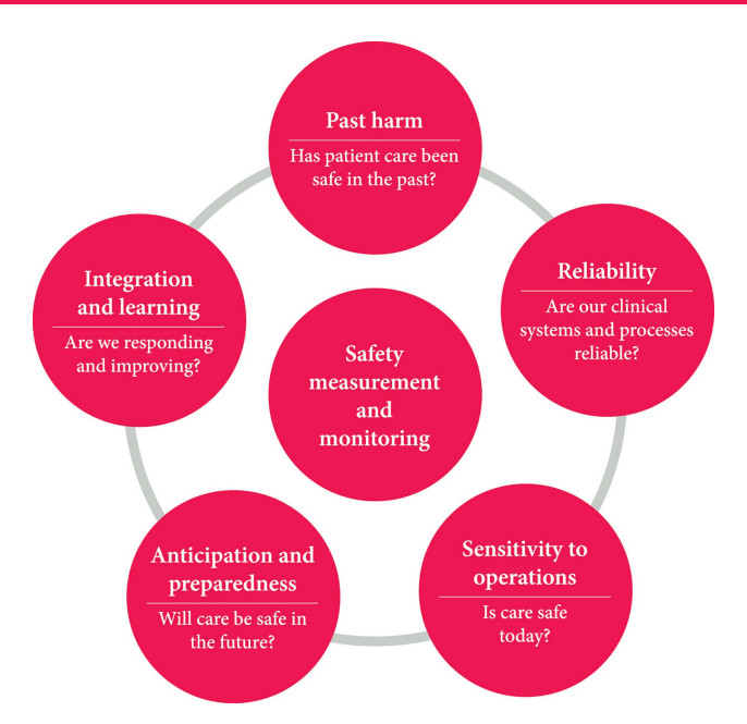
Figure 1 A framework for safety measurement and monitoring.

Protected by copyright, including for uses related to text and data mining, Al training, and similar technologies.